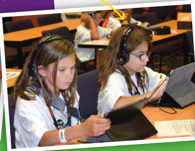
Geek Squad Summer Academy put on by Best Buy came to the Club in August. Club members learned all about 3D Printing, Film Production, Digital Music, and more.