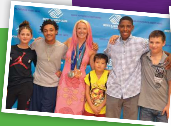
Shannon Bahrke Happe, an American Olympic freestyle skier, visited the Club this summer and shared stories with Club members about winning her Olympic medals in skiing and also took photos with the kids.