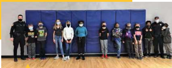
During Spring Break our members got to play dodgeball with Oshkosh police officers.