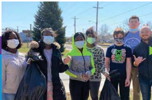
Keystone Teen Leadership Club spent the first day of spring break cleaning up the neighborhood!

The Boys & Girls Club of Oshkosh will be a generation-changing leading provider of programs emphasizing youth development services and family outreach support to meet the needs of young people 6-18 and their families, especially those who need us most.